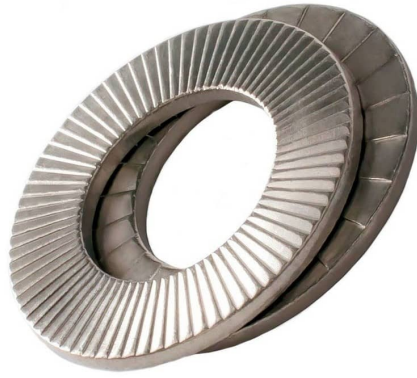
Vention First Release

The Nordlock washer is a two-piece wedge style washer. Each half of the washer has two serrated surfaces: fine serrations on the outside, and larger wedge-shaped serrations on the inside. The fine serrations dig into the parent material when the fastener is torqued. This prevents the washers from slipping against the bolt or joint's surface.